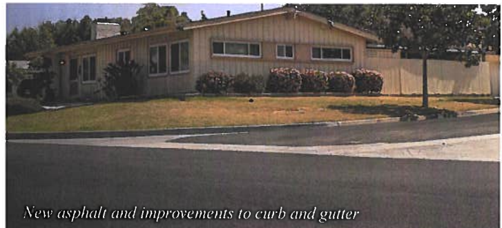
New asphalt and improvements to curb and gutter